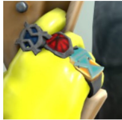
Text 1: Iron ring on trigger finger, Ginstone on secondary finger , Other two rings mysterious?

Outside of the rubber gloves where a collection of rings. “I recommend you call them before they react to me.” Surprisingly his voice came very clear through the masks operating system he noticed his prosthetic foot was actually also solid iron for some odd reason at least for the part that was supposed to be made of metal. Unzipping a little bit more of the backpack that was containing his baseball bat which was also solid iron and placing in the shotgun. “Don't want to look too scary to them.” “I don't have my cell phone I left it with Wendy?” “No worries, I'll just call them what's the number? Wait a minute I have your number never mind.” Opening Up the side pocket, Near the knee where his prosthetic leg would Actually attach.